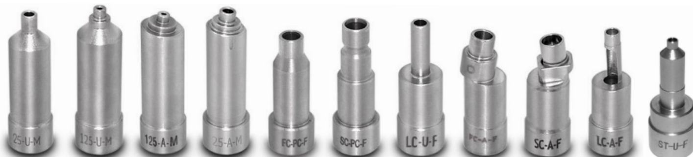
25-U-M 125-U-M 125-A-M 25-A-M FC-PC-F SC-PC-F LC-U-F FC-A-F SC-A-F LC-A-F ST-U-F